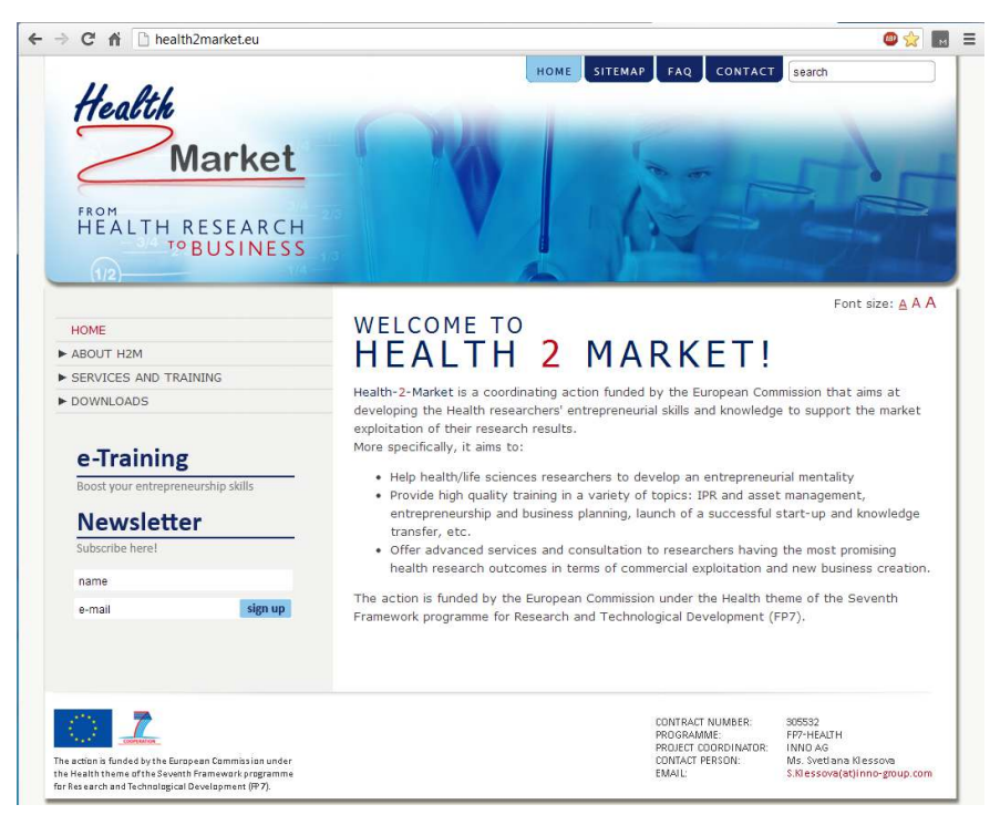
Print screen: Health-2-Market "Home" area

The design of the H2M website has been developed in line with the planned project design elements, for instance, colour codes of the project dissemination strategy. The layout of the "Home" section is presented below: